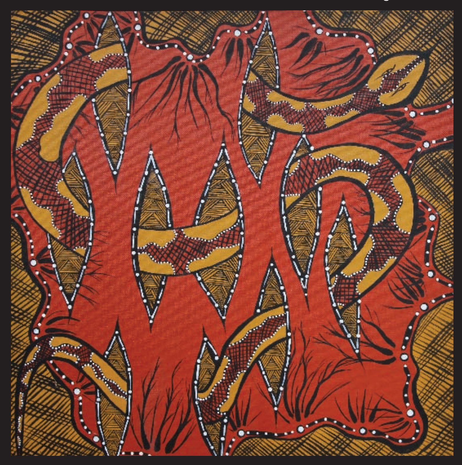
Recognition and Settlement Agreement - Volume 2 of 2 under the Traditional Owner Settlement Act 2010 (Vic)

between Dja Dja Wurrung Clans Aboriginal Corporation and The State of Victoria